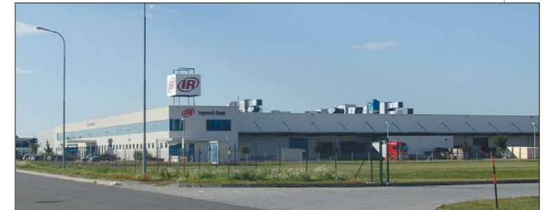
IR AIR SOLUTIONS GROUP